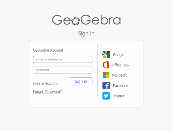
Figure 3.1: Login screen of GeoGebraTube

For GeoGebraTube we want users to create an account and sign in to be able to create and enrol to courses. This can be done very easily by entering an email address, username and a password, or even simpler by choosing to sign in with an existing Google, Office 360, Microsoft, Facebook or Twitter account (see figure 3.1).